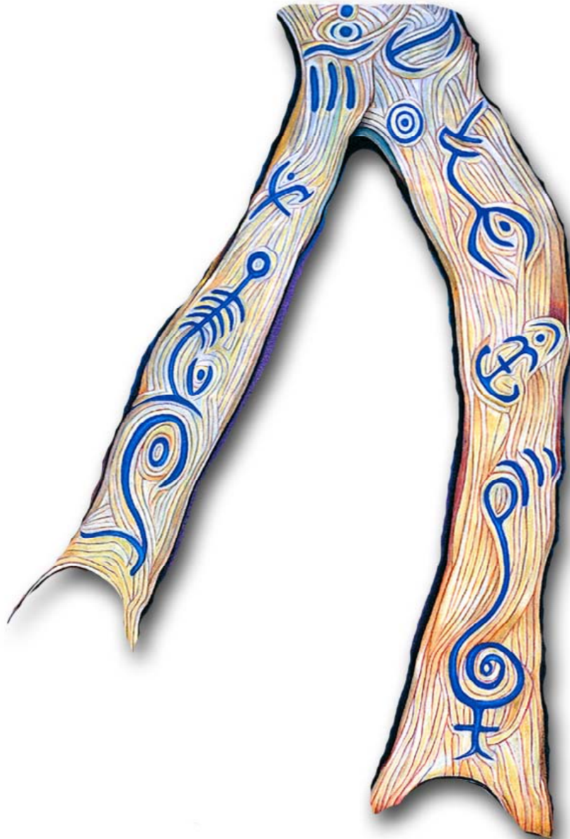
Figure 2 - Glyphs from Chamber Painting 6

Wholeness Navigator: Core wisdom that draws the human instrument to perceive fragmentary existence as a passageway to wholeness and unity. The heart of the entity consciousness it pulls the human into alignment with Entity consciousness – from which the human instrument sees itself as an extension.