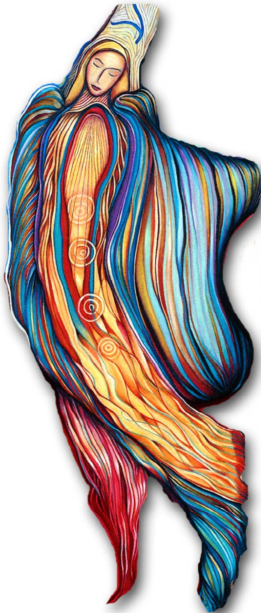
Figure 4 - Sovereign Integral From Chamber Painting 6

On the right-hand side of the painting, the red field of eight infinity notations represents the seven universes of the myth's multidimensional universe and the central universe ( FSCD ACIO ). The tiny seventh is just visible beneath the folds of the landscape and the eighth is between the folds of the landscape. The eighth is just