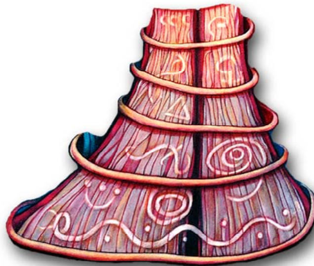
Figure 5 – Red Woman (HI/SE) Glyphs from Chamber Painting 6

multidimensional entity (G&P). The SC are “like DNA”, so the glyph is written in shorthand to characterize a DNA-like spiral with 6 dot-like molecules or codes attached to it instead of a lengthy 23 (Fig. 5). The two horns on the glyph’s head may relate in meaning to ‘horns’, or the two extra 6 th and 7 th senses gained (Sauthers). Many paintings feature variations of this SC glyph. Revealed written in the WingMakers’ language, here it means; “ Source Codes activated in the Sovereign Entity/Human Instrument ”; and it suggests other glyphs in the painting/s are in the WingMakers’ language. A mythical ACIO memo states that about 35% of the glyphs remain un-translated (Stevens) [12].