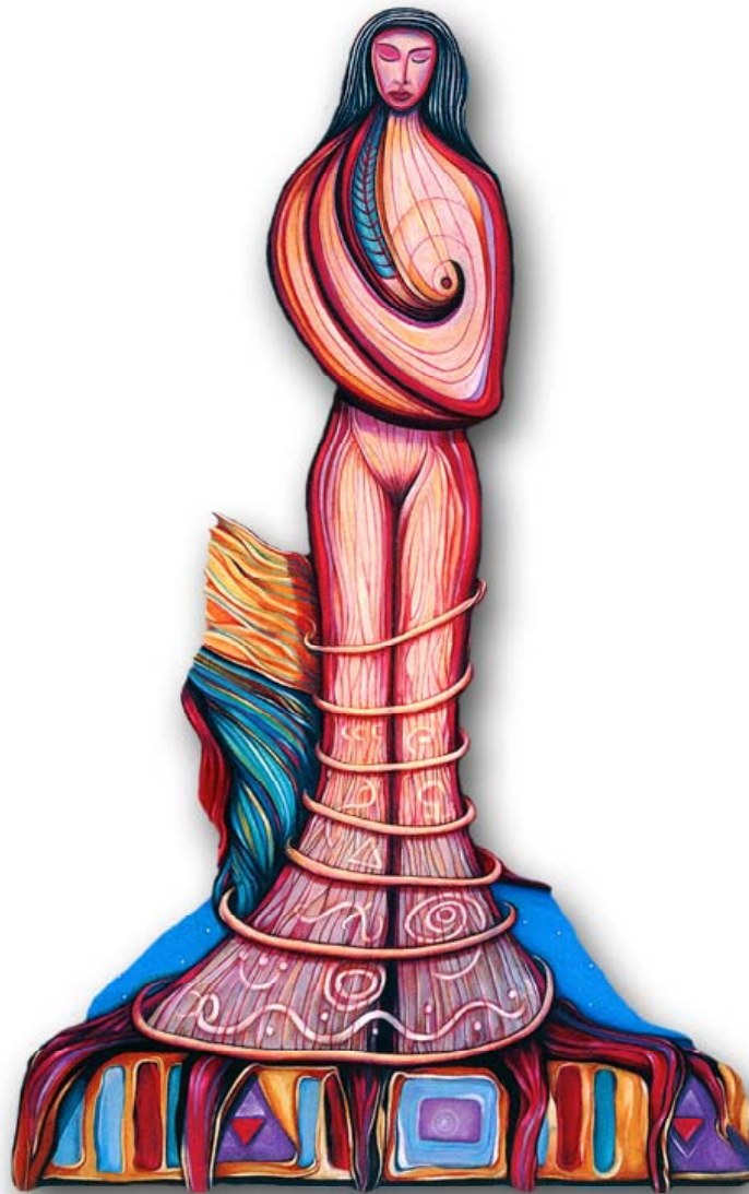
Figure 3 – "Red Woman" (HI/SE) from Chamber Painting 6

The entire picture stands upon the patterned, yellow/gold band. Abstractly showing the unity of all manifested existence, the band contains Creation's primal building blocks originating from spirit. In this painting yellow is representative of the realms of spirit. Chevalier and Gheerbrant (CG) in The Penguin Dictionary of Symbols note that yellow is "the vehicle of divine immortality" and "the color of the gods" (1137). It is from spirit or First Source (FS) that form (the squares) and energy (the triangles) originate (P1, P3). The deep blue upper and lower band edges suggest FS (see below).